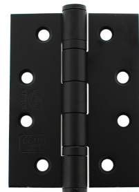
Product Finish Pictured: Matt Black